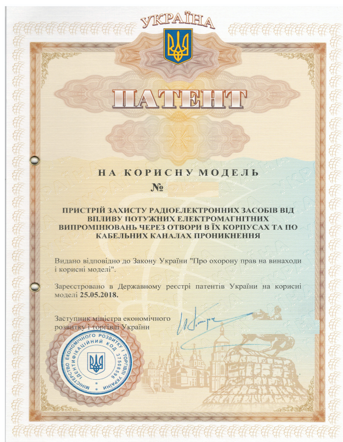
Figure 2. Sample utility model patent

At the same time, the level of legal protection for such patents is lower. It is valid for 10 years instead of 20 years. It is a characteristic feature of Ukraine and, to a lesser extent, CIS countries. In the West, this form of protection for new developments is less popular. From the notion of 'utility model' and the practice of its registration, it follows that such models usually protect less significant developments. Novelty is required, but it is not necessary that the decision be not obvious to experts in a particular field. Thus, in most cases there is no point in exporting it to the developed markets. More than 90% of utility model patents registered by Ukrainian inventors abroad for the